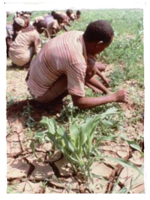
Group of farmers working the fields, Eritrea.

AGRA also states that it will "develop and strengthen Africa's small and medium-scale seed companies to develop and sell appropriate seeds to farmers, develop rural agro-dealers (small rural shops, mainly owned by women), and work with local food processors that can add value to products and local micro-finance institutions."