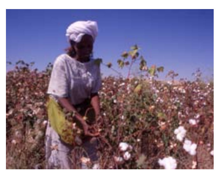
A female farmer in Eritrea.

This statement was signed by 70 African civil society organizations from 12 African countries at the World Social Forum in Nairobi, 2007.