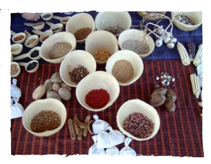
Seed Sovereignty: Farmers display seeds from around the world at the Nyéléni World Forum for Food Sovereignty 2007.

In our experience, the use of traditional seeds and farming systems are also the best means to reduce poverty in rural areas such as Semonkong in Lesotho. The CBDC's Seed and Food Security Programme has made a strong case for promoting traditional farming systems, stating that local seeds and indigenous knowledge will benefit the current population and future generations. Ever since the inception of the CBDC program in 2006, many target farmers have improved their livelihoods. As a result, our approach is gaining acceptance among smallholder farmers who believe in food sovereignty and are joining hands to campaign against technological solutions such as the New Green Revolution for Africa. For instance, Mrs. Makaizara Molapo, a farmer, told our staff, "I find CBDC useful because it tackles prevailing food insecurity and challenges that face smallholder farmers. The CBDC has helped us reduce dependency on agricultural inputs because it promotes seed multiplication, and use and con-