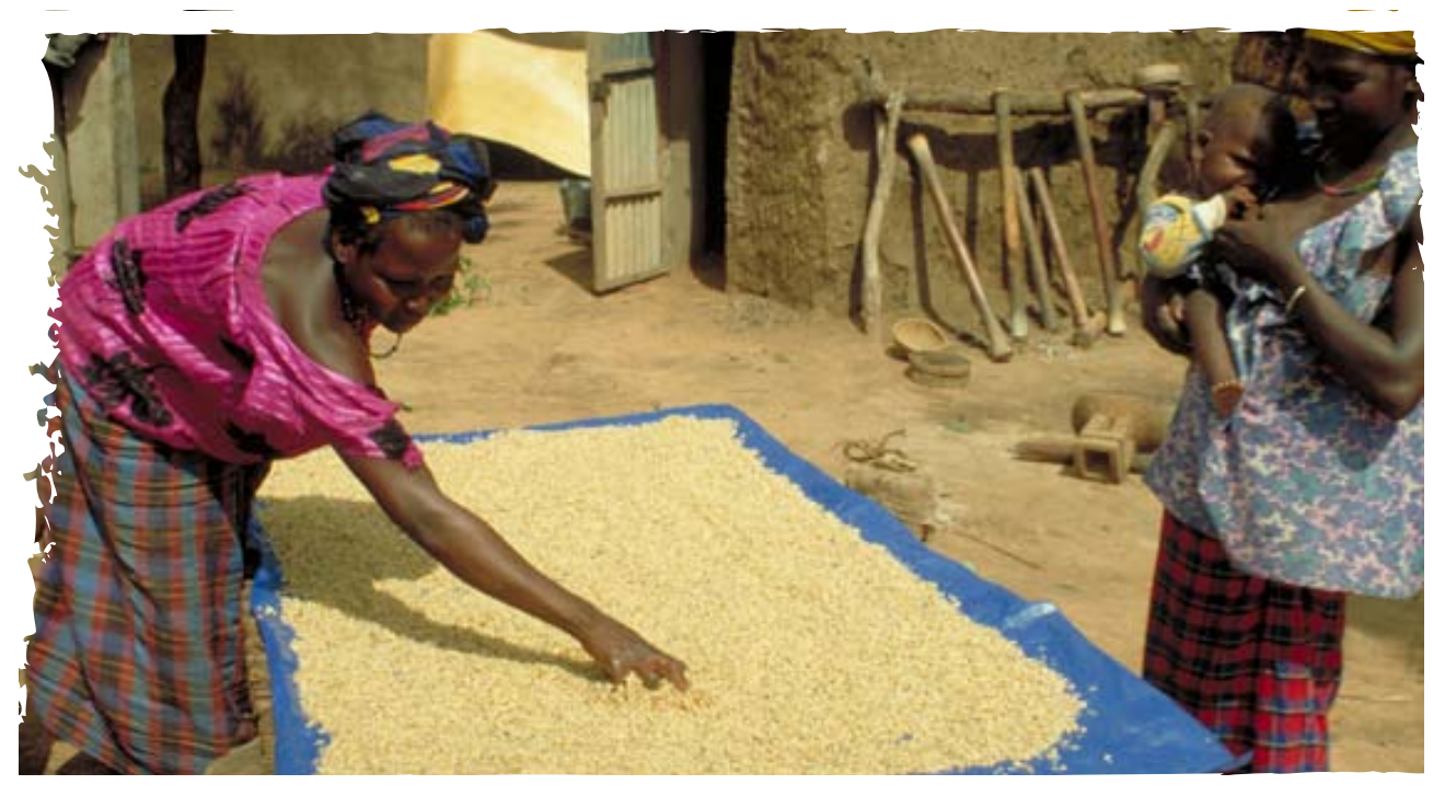
Women in the village of Douga, Mali drying corn kernels in the sun.

Mukoma Wa Ngugi is a political columnist for the BBC Focus on Africa. He is also the author of a collection of poems, Hurling Words at Consciousness (AWP, 2006).