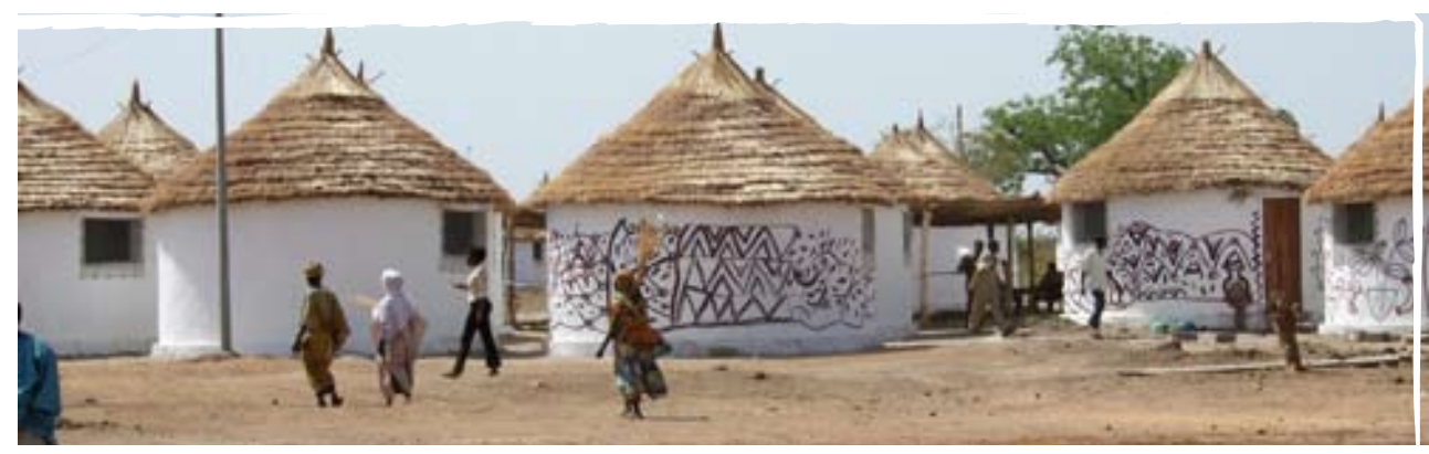
Nyéléni Center, Built for the Nyéléni 2007 World Forum for Food Sovereignty

We believe that God created life, and no one can own it, not even Monsanto, Syngenta, or other multinational companies. We therefore reject all GMOs in agriculture, and call upon the Kenyan government to respect our indigenous expertise. Therefore to be able to fully understand the effects of GMOs on our livelihoods, health and environment, we demand a twenty-year moratorium on GMOs in Kenya.