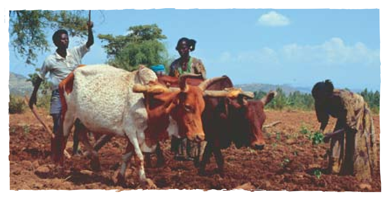
Farmers in Tigray Province in the north of Ethiopia.