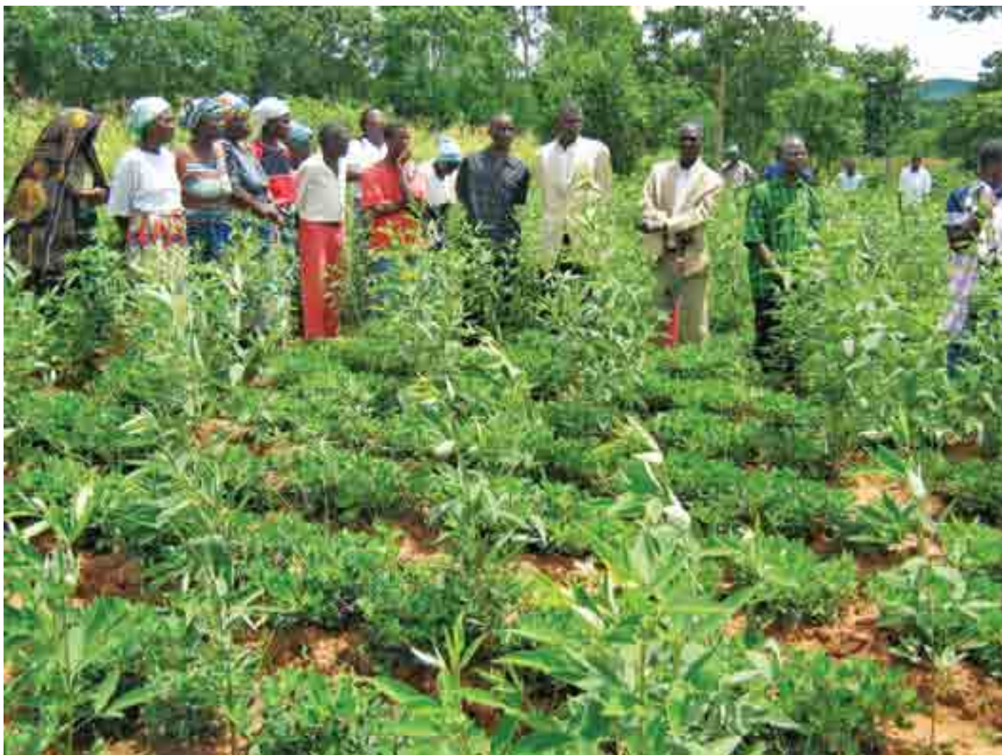
SFHC Project field visit to a groundnut and pigeon pea field in northern Malawi.

with education. 223 Farmers were encouraged to grow legumes such as pigeonpea and groundnut, together with other plants, both as a means of improving soil cover and fertility, as well as providing a more diverse and healthy diet. Nutrition education was given using a 'transformational educational approach' with discussion groups which emphasised dialogue and the importance of local knowledge. Over a six-year period there was a significant increase in child growth figures and dietary diversity for households involved in the project compared to non-participating households.