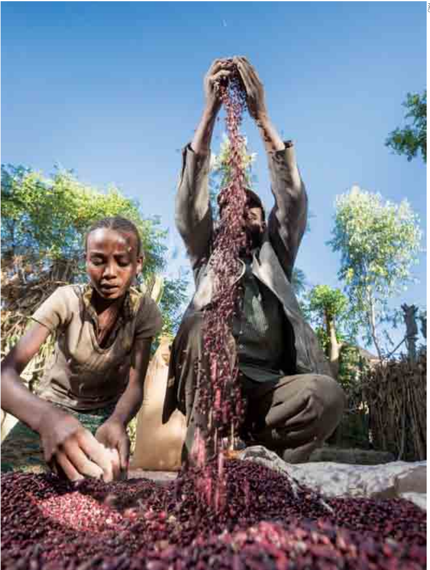
Farmers in Hangachafa Village, Hawassa, Ethiopia, sift beans from dirt, dust and hay.