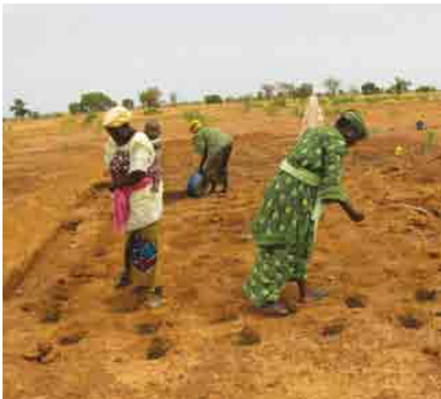
Women sowing okra in zai holes.

The Zai pit technique originated in Mali but was adopted and modified by farmers in Burkina Faso after a particularly bad drought in 1980 which affected over one million people. The technique involves digging a series of pits roughly 20 to 40cm across by 20cm deep during the dry season. Manure is added to the pit and when the first rains arrive the pits are planted with seeds. The pits help to hold some of the surface water which comes during periods of heavy rain. They also help to protect plants and fertility from being washed away and as a result help to increase crop yields – by up to 500% in some cases. 112 Soil water conservation (SWC) techniques like Zai planting, but also stone bunds (stone walls built along contours to help slow surface water runoff) not only help to increase food yields, but they help farmers to grow plants on otherwise degraded and non-productive land. In Burkina Faso's Central Plateau, SWC techniques have helped to rehabilitate over 300,000 hectares of land. 113