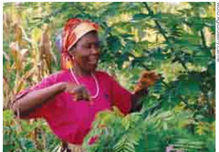
Gliricidia intercropped with maize.

Around the world, peasant organisations, pastoralists, fisher folk, indigenous peoples, women and civil society groups are forming a movement for food sovereignty which allows communities control over the way food is produced, traded and consumed. 2 Food sovereignty, therefore, provides the framework within which agroecological systems and techniques should be developed.