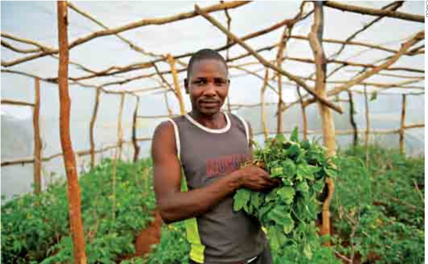
Agroecological farming in a collectively-run greenhouse in Kenya.

“Agroecology encourages a holistic approach and the integration of humans, plants, animals and the environment, into a system where all involved help each other and create important relationships which result in healthy people, healthy plants, healthy animals and a healthy environment”