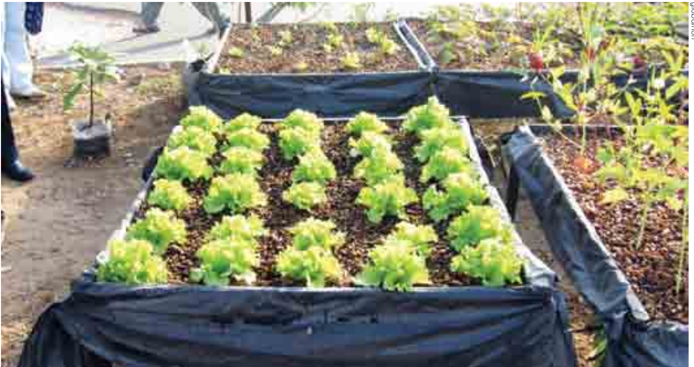
Lettuce grown in urban garden in Dakar, Senegal