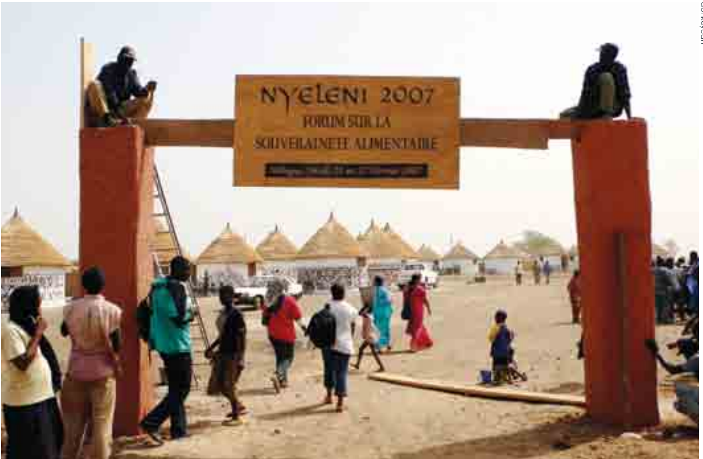
Entrance to Nyéléni, World Forum for Food Sovereignty, Selingue, Mali

The six pillars of food sovereignty were developed at Nyéléni, Mali, in 2007 at the Forum for Food Sovereignty: