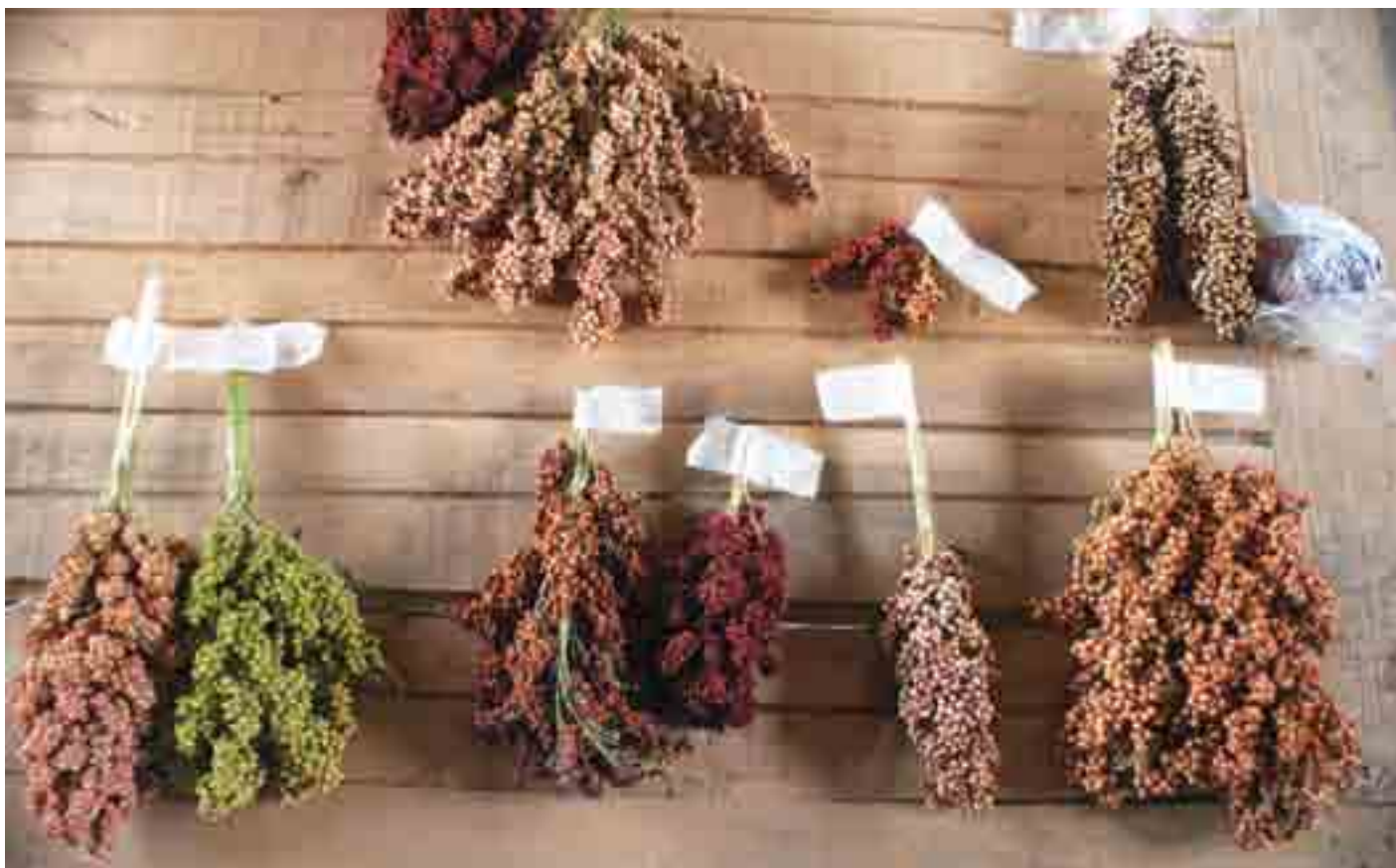
Different varieties of sorghum.