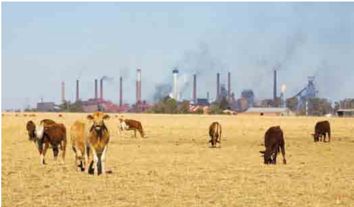
Farm land bordering an industrial area