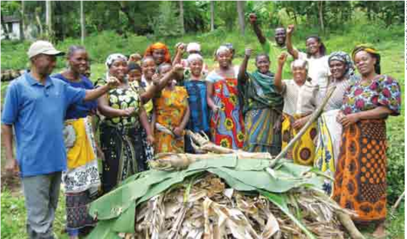
Sustainable Agriculture Tanzania