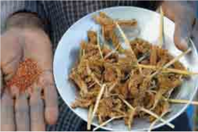
Africa finger millet