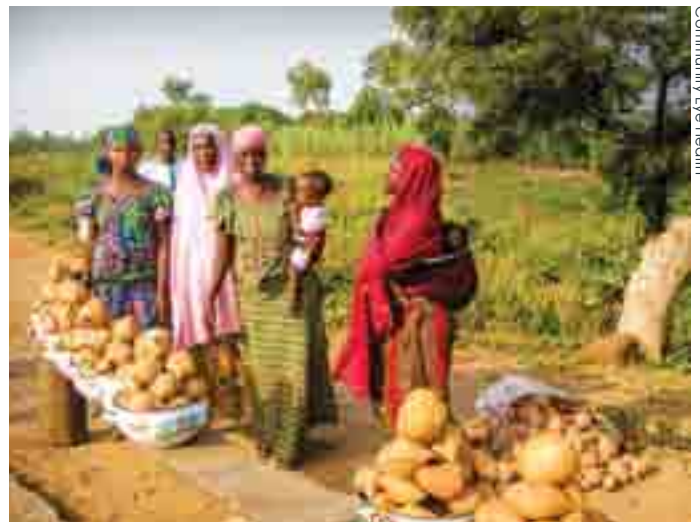
Community Eye Health