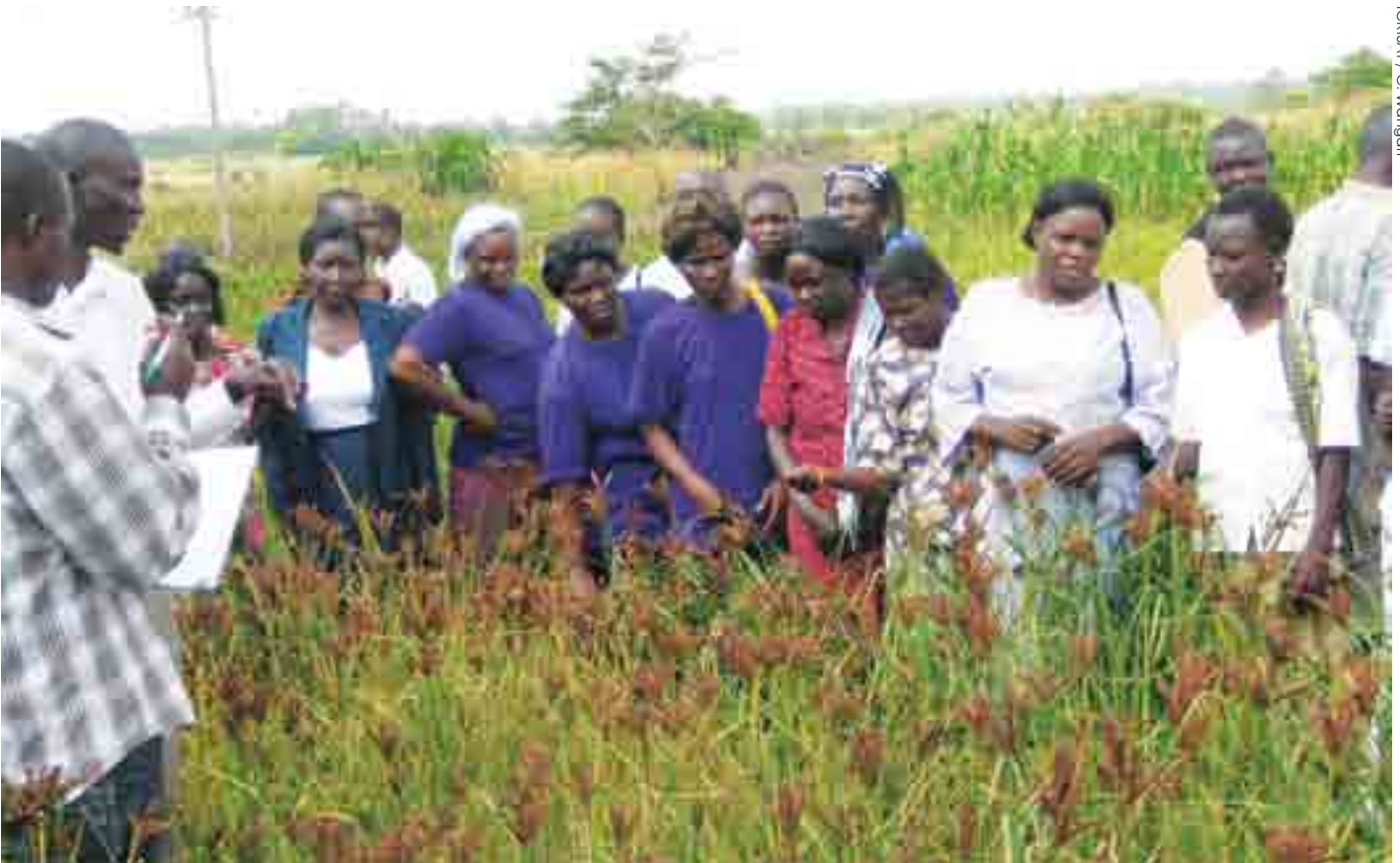
A group of women farmer involved in a participatory plant breeding process to improve finger millet varieties.