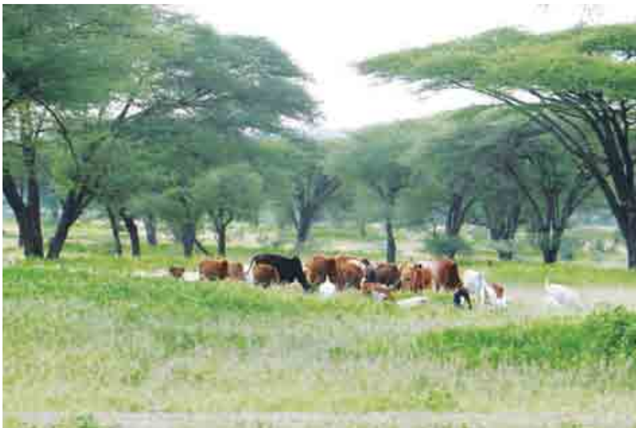
Livestock grazing in a restored Ngitili system