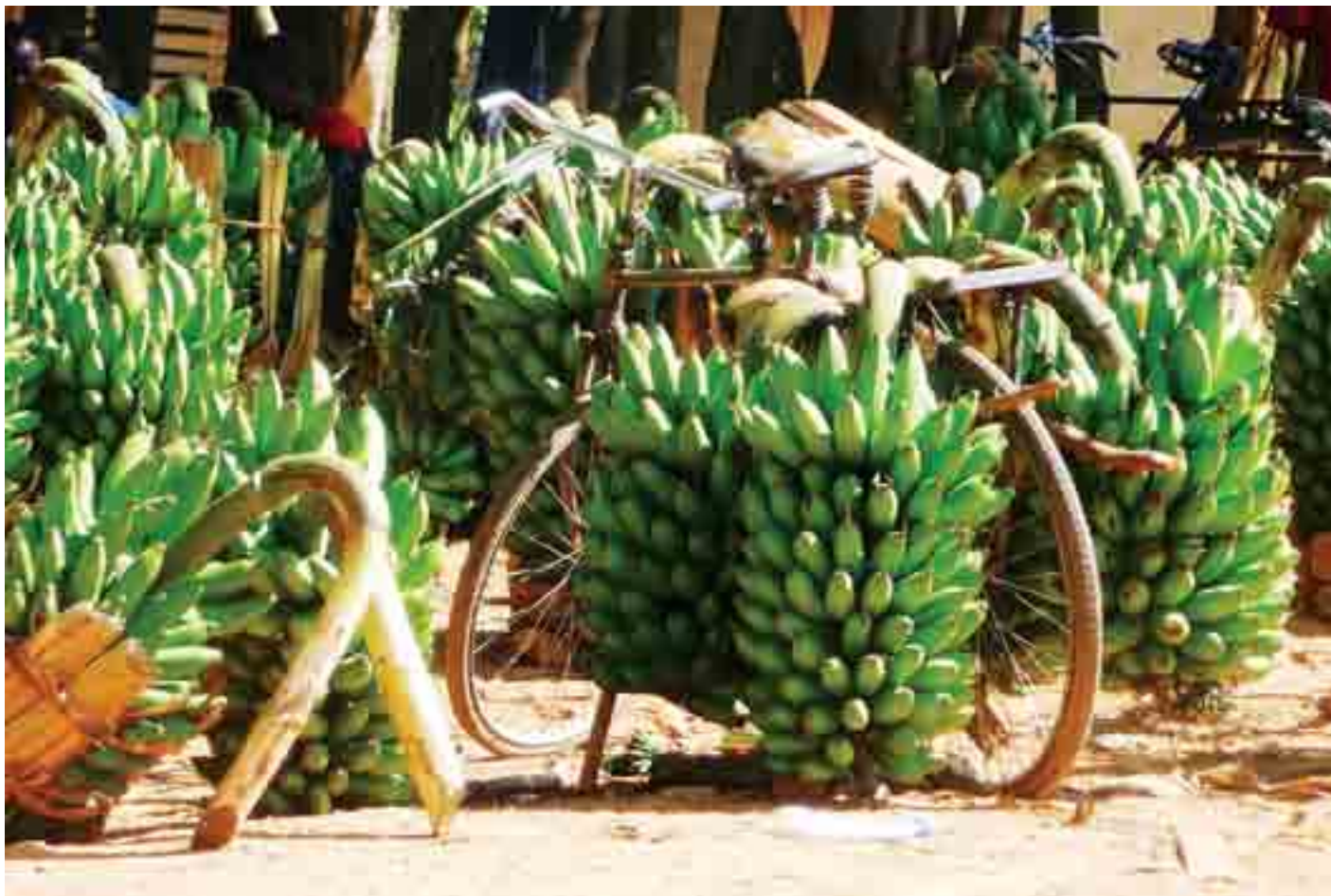
Bananas ready to be taken to market.