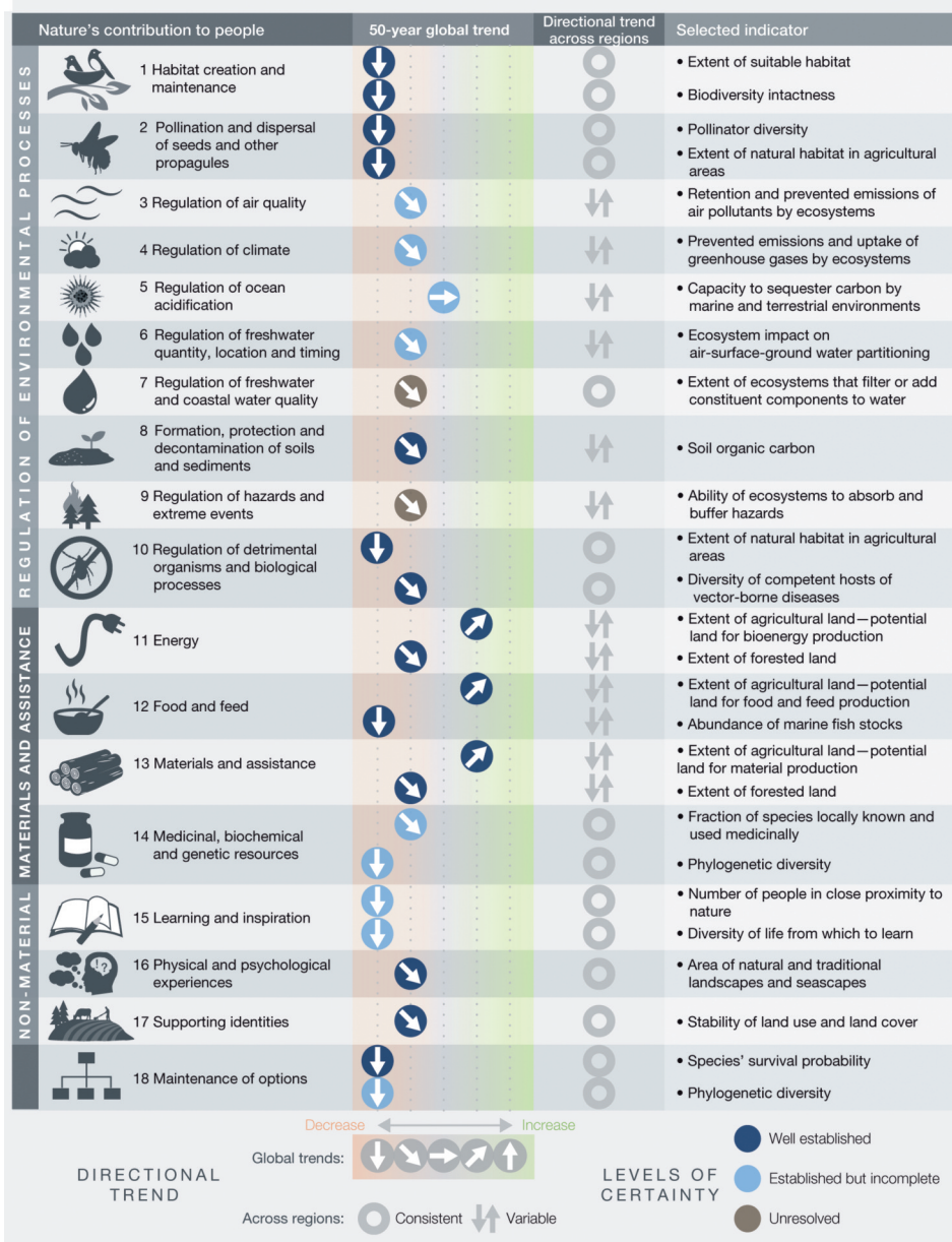
Figure 1. Global trends in the capacity of nature to sustain contributions to good quality of life from 1970 to the present, which show a decline for 14 of the 18 categories analyzed. Data supporting global trends and regional variations come from a systematic review of over 2,000 studies (IPBES 2019: 2.3.5.1). For many categories, two indicators are included that show different aspects of nature's capacity to contribute to human well-being. Figure from IPBES 2019 [1].