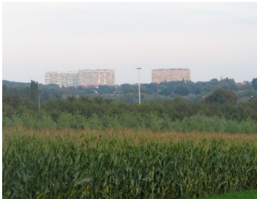
Figure 1: Landscape in the fringe of Brussels with an agricultural character.

Rural areas are also subject of a rapid urbanisation process, especially in many European regions, like the fringe of Brussels (Figure 1). Modern traffic and communication technologies have exported the urban way of life to the countryside putting pressure on rural traditions and way of life. It makes that the traditional harmony and responsiveness between agriculture and society has been broken and requires reinstatement (Delgado et al. , 2003).